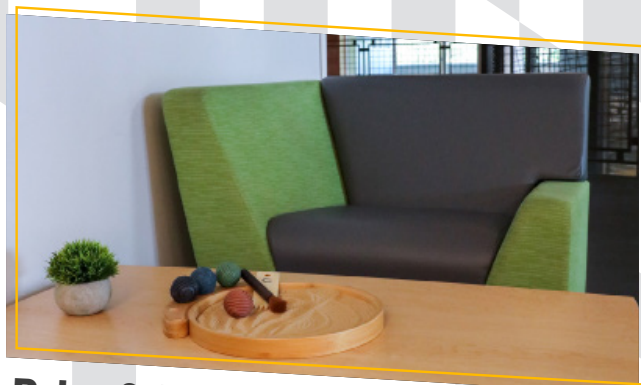
Relax & Stay Awhile Social Areas