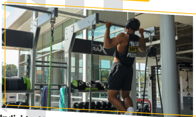
Individual Workout Bays on the Functional Floor