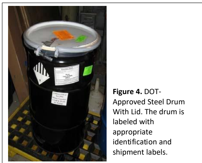
Figure 4. DOT-Approved Steel Drum With Lid. The drum is labeled with appropriate identification and shipment labels.

iii) Ballasts will only be accumulated in properly labeled DOT-approved 30- or 55-gallon steel drums. Only non-leaking drums in good condition will be utilized for the storage of ballasts (shown in Figure 4). Approved drums are available from EHS at (410) 704-5500 or safety@towson.edu . Please allow five (5) business days for delivery.