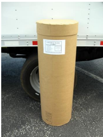
Figure 1. Cardboard Fiber Tube With Lid. Fiber tubes are used for safe storage and transport of lamps.

ii) Loose lamps will be segregated by type and stored and transported in closed DOT-approved cardboard tubes (shown in Figure 1). Only containers in good condition will be utilized for storage of recycled lamps. Fiber tubes should only be used with lids.