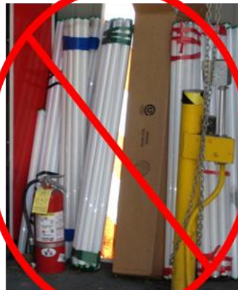
Figure 2. Improper Storage. Bundled lamps stored loosely, leaning upright or slanted against walls with incompatible equipment, risks breakage and penalties.

iii) Any broken lamps will be immediately cleaned up using techniques that will minimize dust production and the debris placed into a separate leak proof container specifically for the collection of broken lamps (See Appendix A). No trash or other debris will be placed into these containers. Broken lamp containers will be labeled as required below in Step A3b.