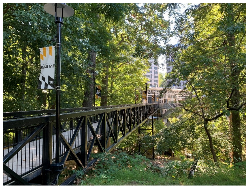
Natural landscape features define the Glen area of campus.

One of the distinctive elements of the campus' natural form is topography, which also creates accessibility challenges. University investments over time have improved the accessibility of the campus grounds, particularly east-west circulation associated with Towson Way. Accessible north-south connections are very limited.