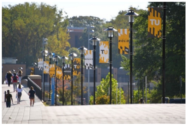
Towson Way connects the Campus Life Center to West Village

Along with the pressures of increased enrollment, the physical condition of many existing buildings has deteriorated due to heavy use and age. Pedagogy, research, and associated technologies have evolved significantly since many campus buildings were designed and built. Many facilities require major renovations to accommodate the evolving needs of teaching and research and to allow existing buildings to function more effectively and efficiently or be considered for demolition. Towson University's strategy to responsibly address existing space deficits while modernizing existing facilities necessitates the need for a careful phasing of capital facility projects.