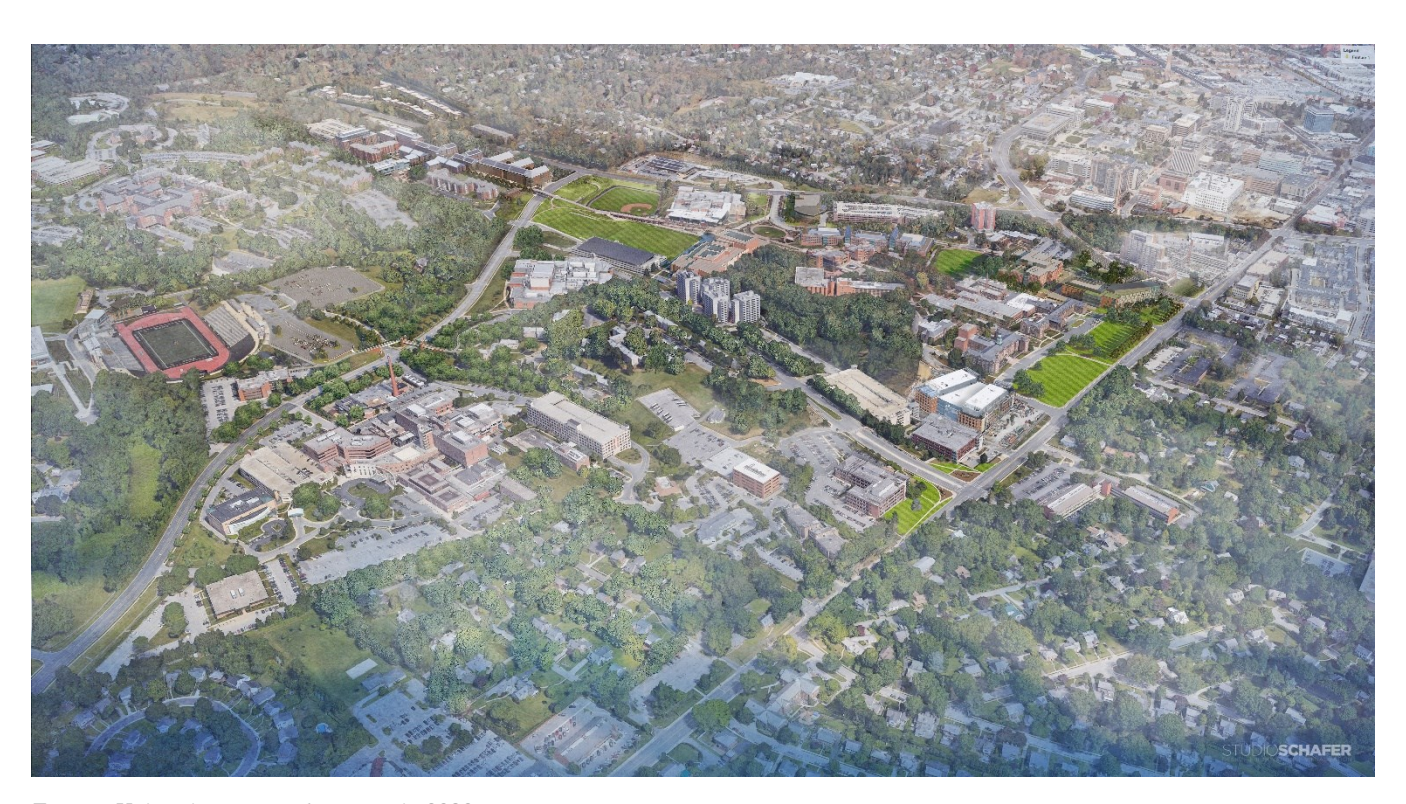
Towson University proposed campus in 2030

The campus master plan will inform university decision making years into the future. Many circumstances evolve and change over time, including potential growth and change of the campus community and the physical space they require. The space assessment is a tool to explore potential future facilities needs quantitatively. The space projections applied in this assessment use Fall 2019 enrollment as a baseline. As Towson is designated as a growth institution by the University System of Maryland, the university projects 0.5% annual growth. This trajectory would result in a 5.5% increase from year 2019 to 2030.