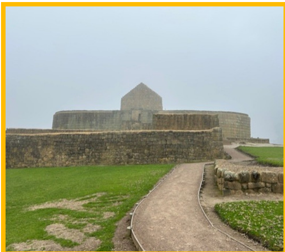
Photos of traditional dancers (top) and Inca ruins (bottom) taken in Ecuador during undergraduate study abroad minimester 2025