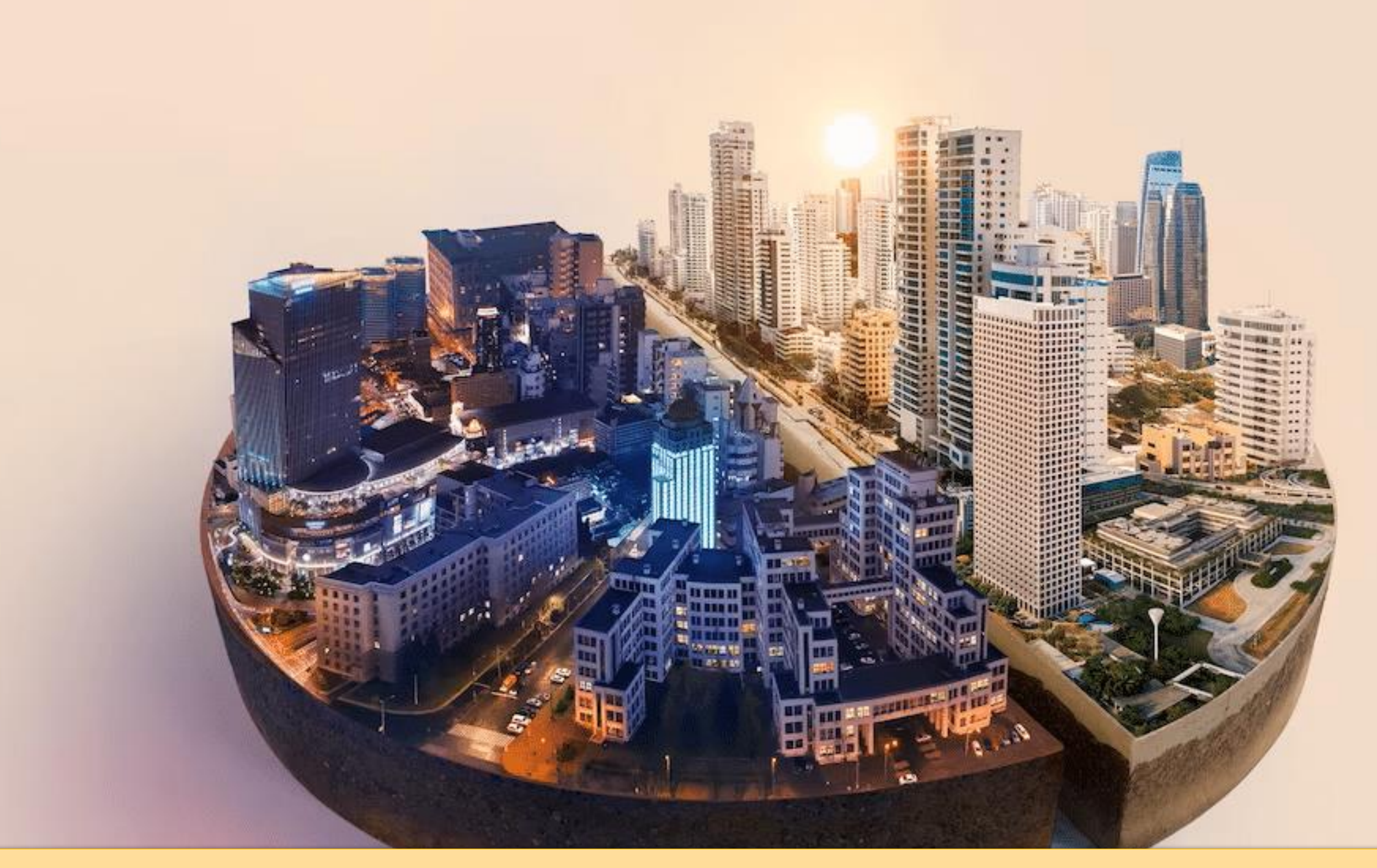
GEOG 405: Comprehensive Planning GEOG 406: Planning for Climate Change