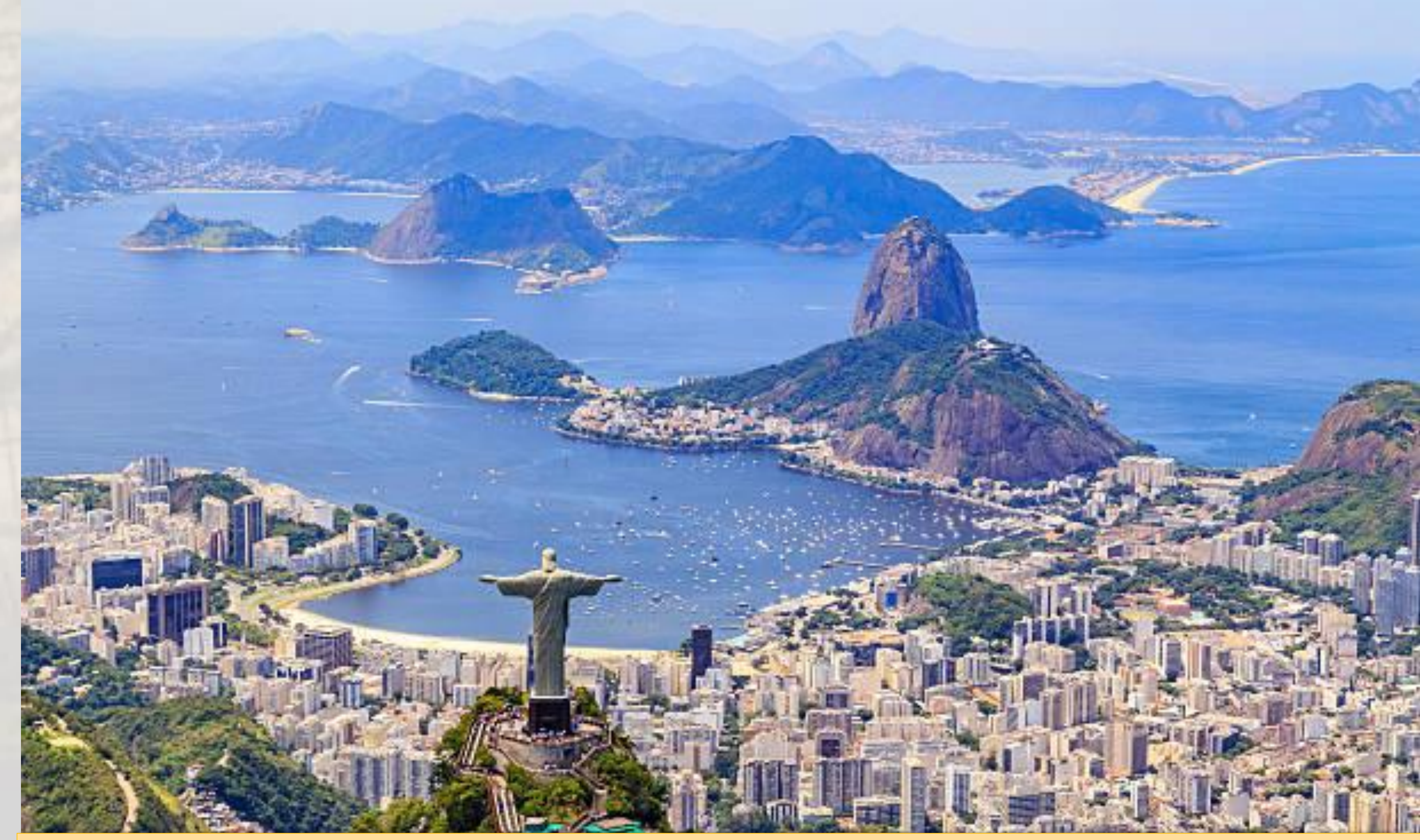
GEOG 461: Geography of Latin America GEOG 404: Securitizing the City