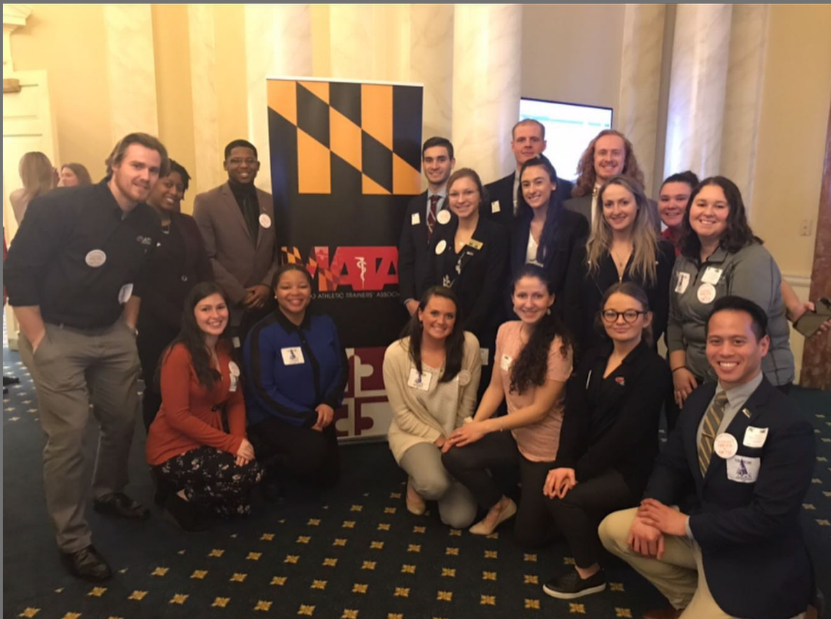
TU Athletic Training alumni and current students at Lobby Day