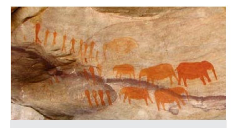
MODERN THEMES IN PREHISTORIC ROCK ART Ahmed Achrati