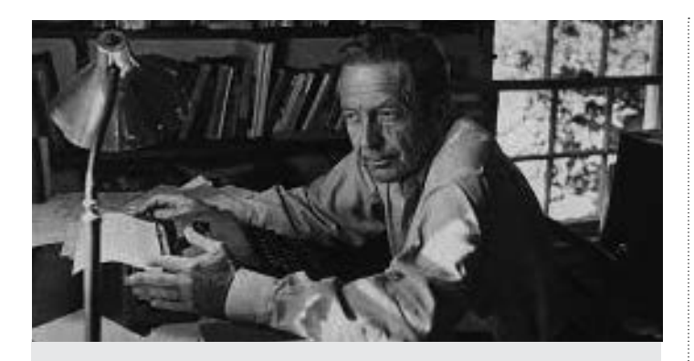
Updike CHEEVER AND UPDIKE