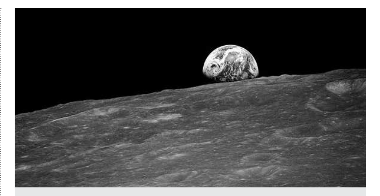
DISCOVERING THE UNIVERSE Jim O'Leary

$65 for one course;$130 for two four-week courses or one eight-week course;$150 for an unlimited number of courses.