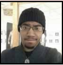
What are you studying at Towson University?