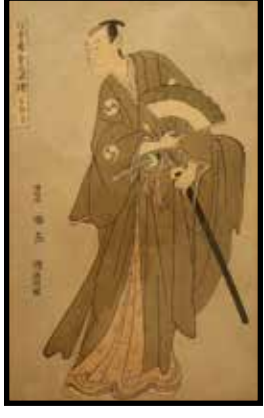
Japanese Woodblock Print of Kabuki Actor, Otawa-ya Onoe Matsusuke, as Oboshi Yuranosuke In the Play, The Forty-seven Samurai Asian Arts & Culture Center Collection, P-026

Local Learning is a national network of professionals interested in connecting young people to folklore and traditional and local culture. Local Learning and the Dress to Express project are supported by the National Endowment for the Arts.